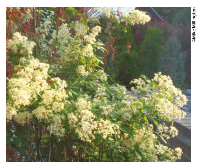
Figs 6a Looking down on C. uncinata, the white flowers looking golden in the winter sun

Directly outside the back of my house is a patio area, boxed in by the house and the high brick wall of my neighbour's garage at a right angle to the house, so well protected from the worst of the cold winds. This is where I planted the replacement, about 10ft away from the house and next to the brick garage wall, protected on all sides except the south-east.