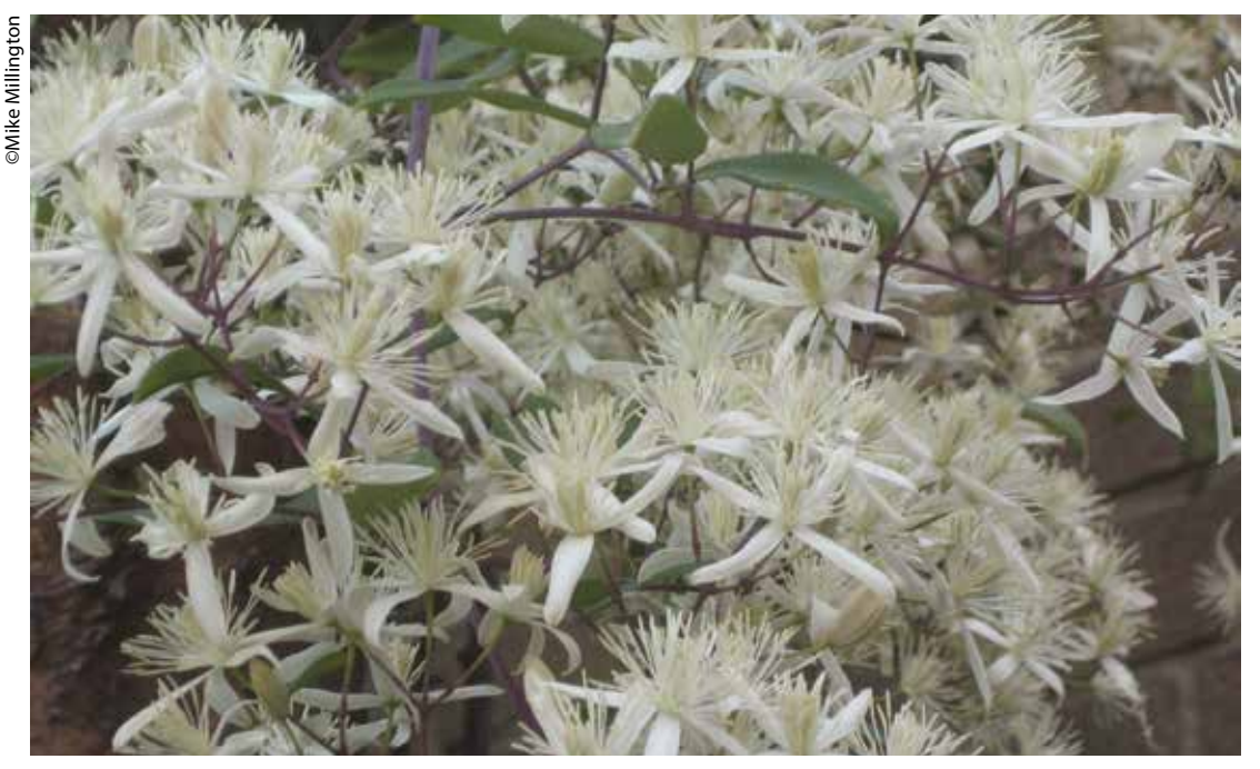
Fig. 6b C. uncinata