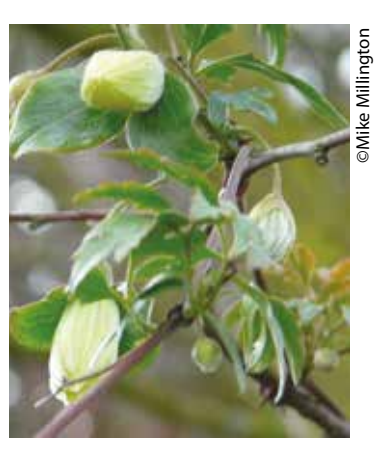
Fig. 2a C. cirrhosa var. balearica flower buds.

(figs 2a, b & c) Fairly well known as a good garden plant, many named cultivars are also available. I like the original species, and this is the second plant I have grown. The first, planted to grow up the same tree, survived for ten years then one summer it died for no obvious reason. Its replacement was planted late in 2009, just before the coldest winters in recent times.