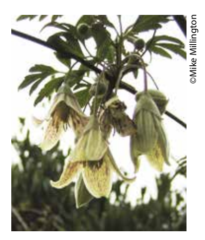
Fig. 2b Maroon-speckled flowers delight on a cold winter day.