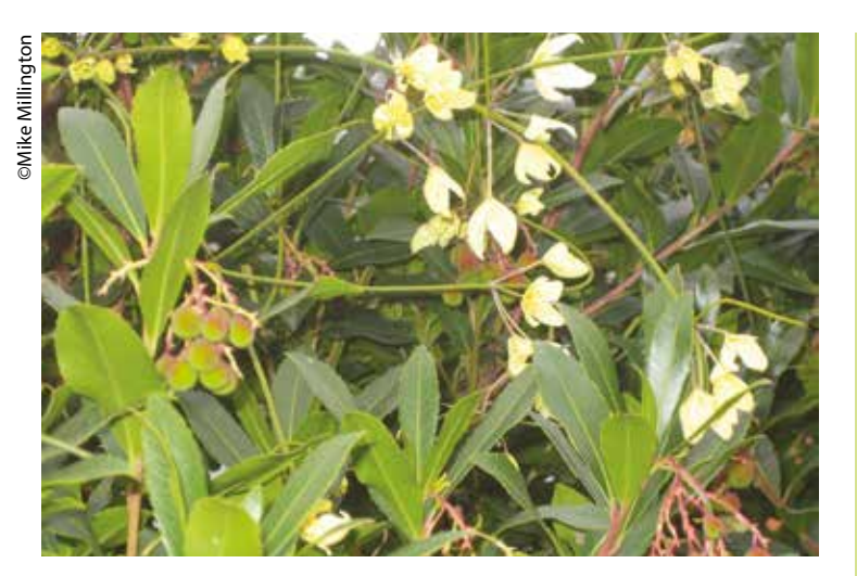
Fig. 1 C. afoliata in a strawberry tree. What look like tendrils are really leaves.

Most evergreen clematis are not considered reliably hardy in most of the UK. The standard exception is C. armandii and its cultivars, which the RHS lists as frost hardy to -5°C, though recommending a south- or west-facing sheltered position. I haven't grown C. armandii , but I've grown a number of other evergreen clematis with some success.