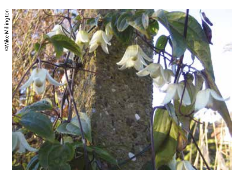
Figs 3a & b C. urophylla 'Winter Beauty'.