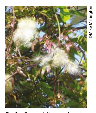
Fig. 2c Bronze foliage and seedheads.