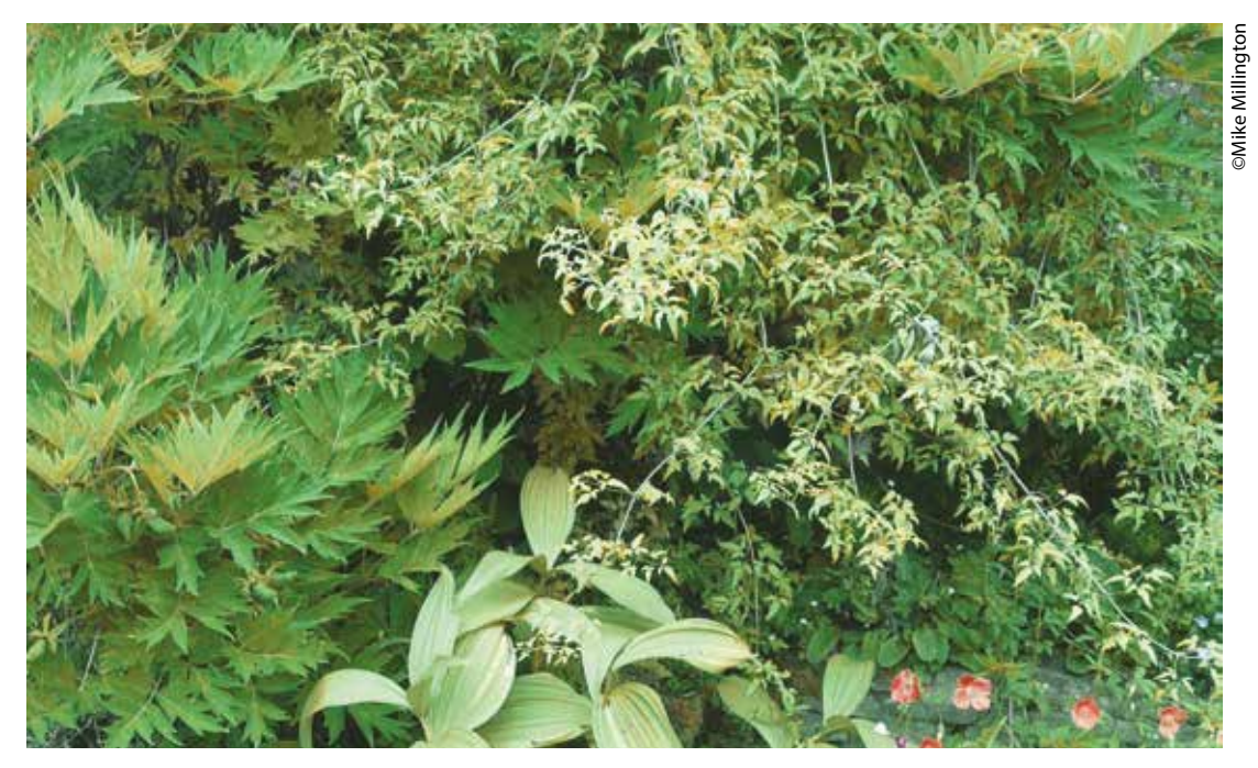
Figs 4a, b & c C. napaulensis attempting to cover a tree peony and a veratrum.