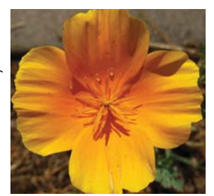
Fig. 6 Eschscholzia californica, California poppy

columbariae (figs 2 and 3), a plant that is sometimes used as a cultivar. Gwyn and Dave think that the chia nuts have a watermelon taste. Mono Lake is not far away, another location for films including High Plains Drifter . Close by is Death Valley, where Michelangelo Antonioni's Zabriskie Point was filmed.