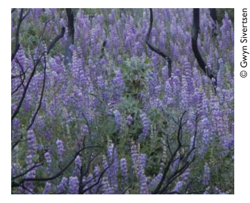
Fig. 4 Lupine longifolius, bush lupine

Let's begin by making a jog to the east and north of the Tehachapi Range on to a little finger of the Mojave that contains the small town of Olancha in the Owens River Valley in California. The Owens River figures as a key, if mysterious player, in Roman Polanski's Chinatown . The film is about murder and incest, but also the theft of water rights, and there is an allusion to Californian history. Many people today will tell you that water from the Owens River was stolen for Los Angeles by William Mulholland during the first half of the twentieth century and that the theft continues. To the west of the Owens Valley are the Sierra Nevada Mountains, which contain the world's largest plant, the California Redwood. To the east are the White Mountains, which contain the world's oldest plant, the bristlecone pine. To the east of Olancha along State Route 190, and at an elevation of three or four thousand feet, we find long blue-purple chia, Salvia