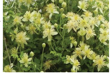
Fig. 10 Clematis lasiantha, virgin's bower

Were we to continue on Interstate 10, we would leave California and enter Arizona. But instead we branch off and head northeast after passing Joshua Tree National Park. Heading on 95 towards Kingman, which is over the state line in Arizona, we find Virgin's Bower, Clematis lasiantha (fig. 10). This plant's widely spread throughout the region, so we really did not need to pass this way to come across it. White or pipestem clematis, as it is also called, is striking when it appears as a tangled, flowering mass in the shrub/heathland known as chaparral. It will cover a Manzanita as tall as 3–5m, so that the evergreen tree, now merely an armature, disappears. The clematis flowers eventually develop feathery ends which traditionally have worked nicely as tinder for hikers. In