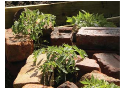
Fig. 12 Garden tomatoes in "high desert" conditions

The small city of Kingman, Arizona, is on the eastern edge of the Mojave. It is at Kingman that we join Interstate 40, which divides from old Route 66, and takes a direct route through the jagged Black Mountains towards Flagstaff. Nevertheless, old Route 66 still remains, running north and skirting the mountains on its way to the tiny town of Seligman. Popular with nostalgia buffs, this segment of 66 is the longest remaining stretch that still retains any of its