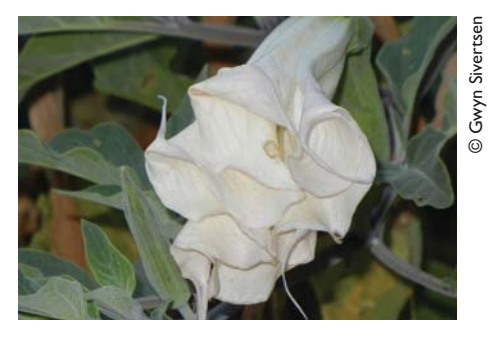
Fig. 8 Datura stramonium, Jimson weed

Having visited the San Gabriel Mountains, let's move south and east to what is more recognizable as desert and find an oasis. The oasis we have chosen is home to the only palm native to North America, Washingtonia (fig. 7), which likes to put its roots down in earthquake-prone areas such as this, where fissures create seeps and springs. Notable among the geological faults is the famed San Andreas. Do you remember the Superman film in which it figured? Along with the Washingtonia filifera is a robusta . Both species can grow to 20 metres in height and filifera is widely used as an ornamental in Southern California. The fruits of both can be eaten by humans and are consumed by birds and moth larvae. Close by this oasis is the posh retirement community of Palm Springs. Bob Hope, Bing Crosby and Frank Sinatra built vacation homes here in the 1930s, presumably because the settlement is no great distance from Hollywood. It is still a popular place to go for golf in December and January.