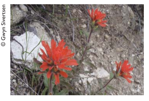
Fig. 11 Castilleja chromosa, Indian paintbrush