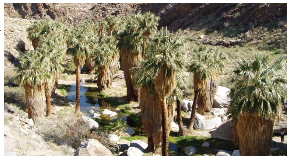
Fig. 7 Washingtonia filifera, native palm