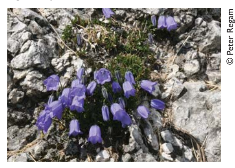
Fig. 23 Campanula cochlearifolia