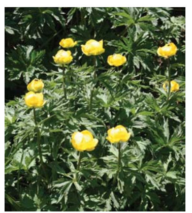
Figs 31 & 32 Trollius europaeus

(fig. 23). In these higher, similarly exposed places we found a deep pink Dianthus glacialis (fig. 24), the toadflax, Linaria alpina (fig. 25), and surprisingly a sea-level plant, Armeria maritima (fig. 26). In this environment grow attractive Potentilla nitida (fig. 27), which is found only on dry limestone rocks, and another plant also from the Rosaceae family, a double-flowered Dryas octopetala (fig. 28). The dwarf shrub Daphne cneorum (fig. 29) is similarly restricted to limestone areas in the wild, but it seems more tolerant in cultivation. Surprisingly perhaps, another dwarf shrub was from a genus usually associated with acid soils, Rhododendron ferrugineum (fig. 30).