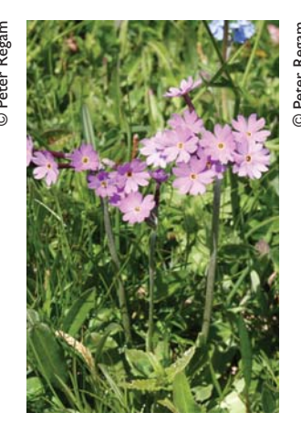
Fig. 3 Primula farinosa