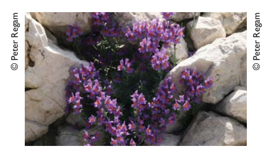
Fig. 25 Linaria alþina