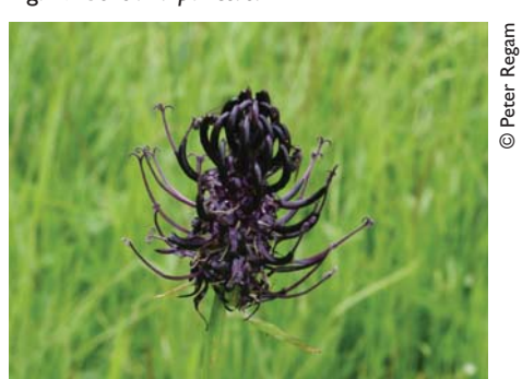
Fig. 21 Phyteuma orbiculare