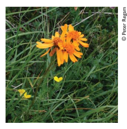
Fig. 11 Senecio abrotanifolius

Gentians were the most diverse genus we saw, with at least five species. Some blue-flowered members of the genus we photographed were Gentiana bavarica (fig. 14), G. terglouensis (fig. 15), G. clusii (fig. 16) and G. utriculosa (fig. 17). These are all very similar and probably only of interest to a specialist grower. There was also a rare UK native known as the Chiltern gentian, Gentianella germanica (fig. 18). Quite different,