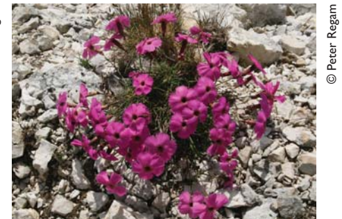
Fig. 24 Dianthus glacialis