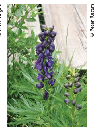
Fig. 2 Aconitum napellus