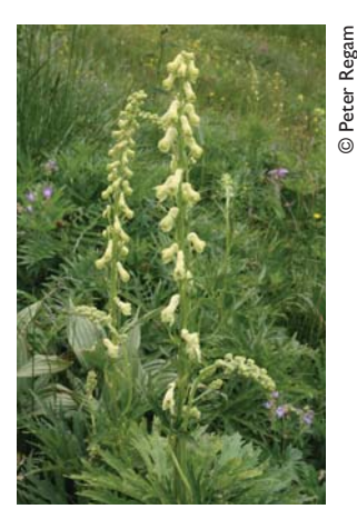
Fig. I Wolfsbane, Aconitum lycoctonum subsp. vulparia

There are usually relatively flat areas of grassland, or even farmed land, around the top of the lifts. Walking through these areas, and on woodland edges, we found the wolfsbane, Aconitum lycoctonum subsp. vulparia (fig. 1), its yellow flowers making a