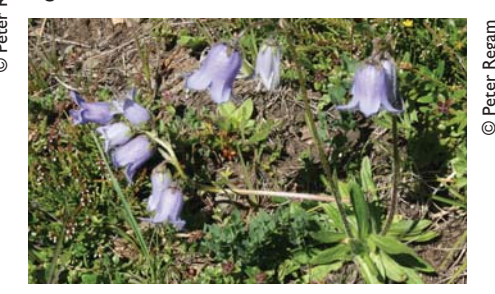
Fig. 22 Campanula barbata