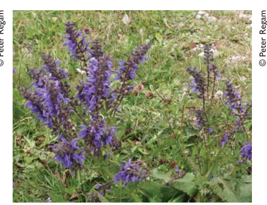
Fig. 12 Salvia pratensis