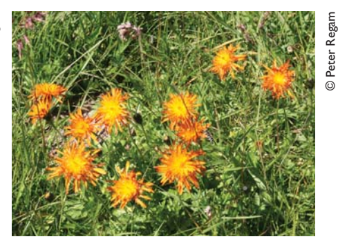
Fig. 9 Bubhthalmum salicifolium