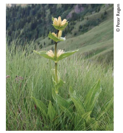
Fig. 19 Gentiana punctata