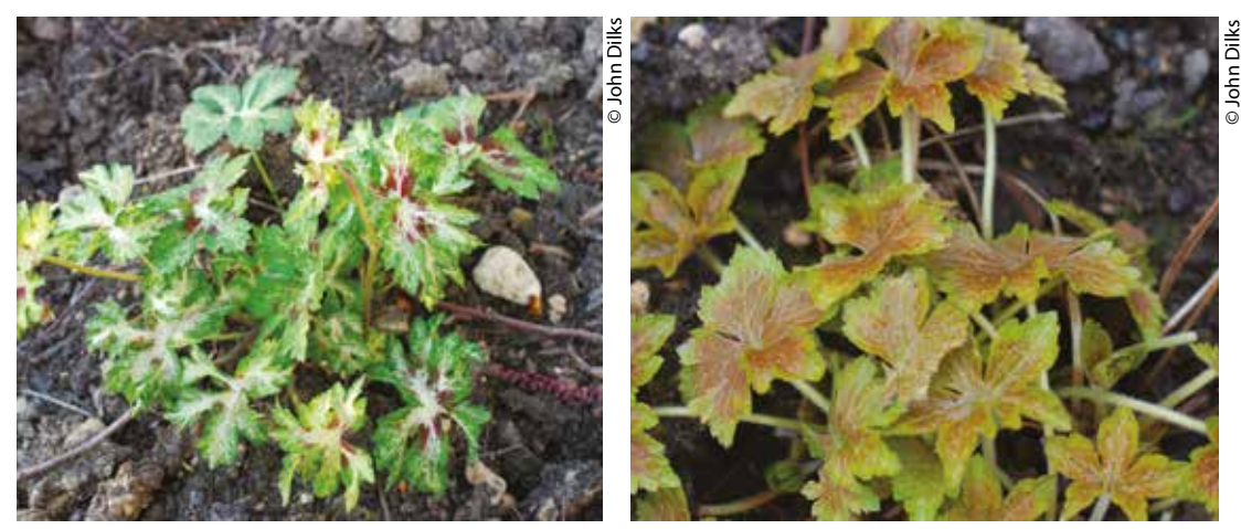
Geraniums includes comments on foliage. Here are two examples of what I think is spectacular early foliage. G. phaeum 'Springtime' and G. x oxonianum 'Walter's Gift' announce the imminent arrival of spring and light up a corner of my garden.

It is a measure of the prolific programme of hybridisation that back in 1990 the Plant Finder listed about 250 hardy geraniums, while the 2015 edition lists about 800.