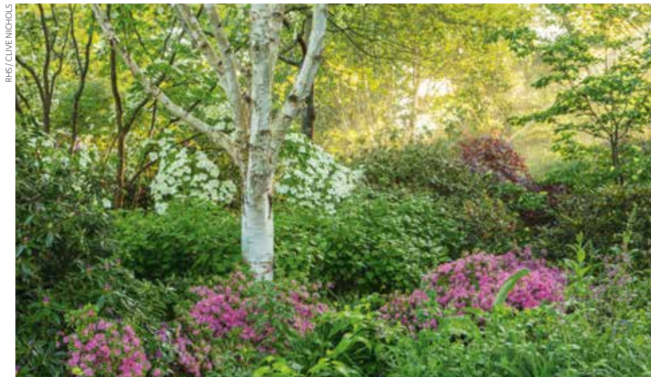
RHS / CLIVE NICHOLS