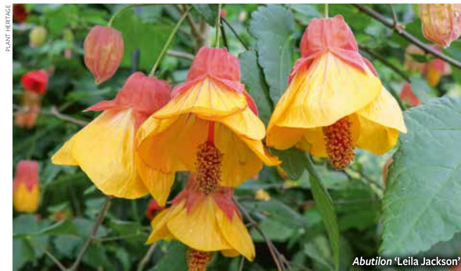
Abutilon 'Leila Jackson'