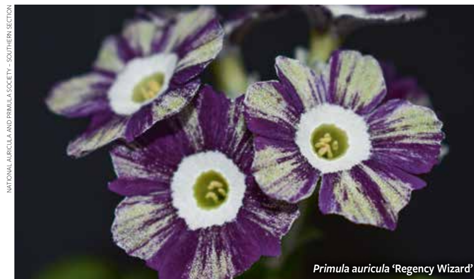
Primula auricula 'Regency Wizard'