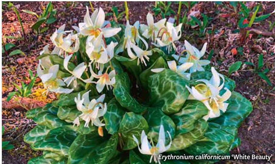
Erythronium californicum 'White Beauty'