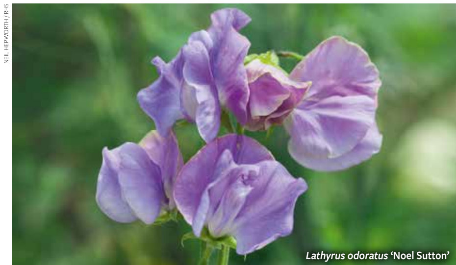
Lathyrus odoratus 'Noel Sutton'