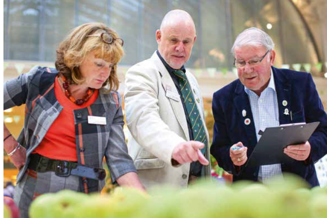
The judging at RHS competitions is supported by committee members.

Formed in 1936 as the Joint Rock Garden Plant Committee, the committee consists of experts in these specialised plants and their diverse growing conditions. As well as its own