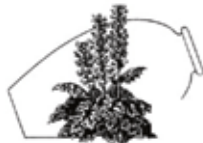
The Mediterranean Garden Society