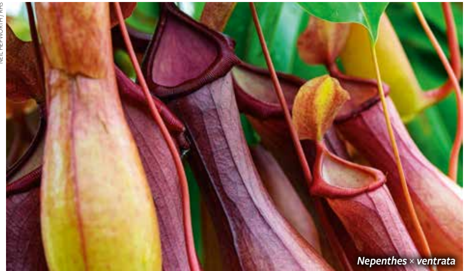
Nepenthes x ventrata