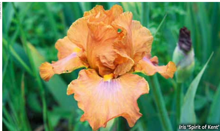
Iris 'Spirit of Kent'