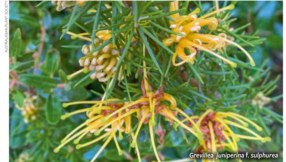
Grevillea juniperina f. sulphurea