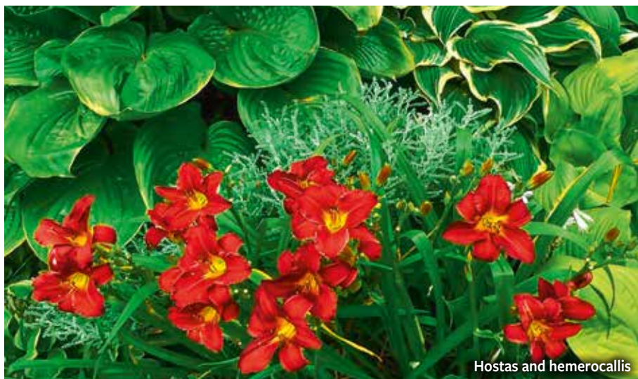
Hostas and hemerocallis