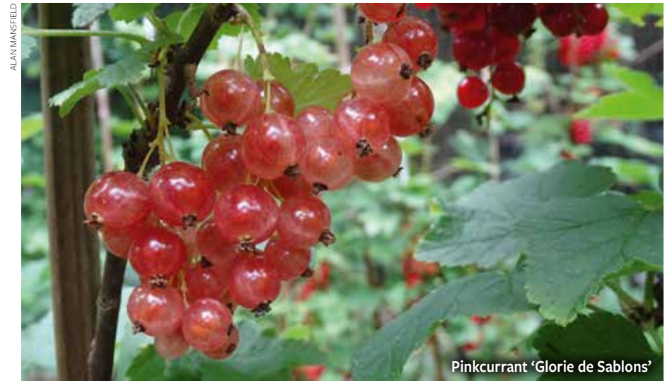
Pinkcurrant 'Glorie de Sablons'