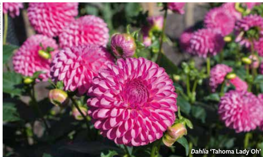
Dahlia 'Tahoma Lady Oh'