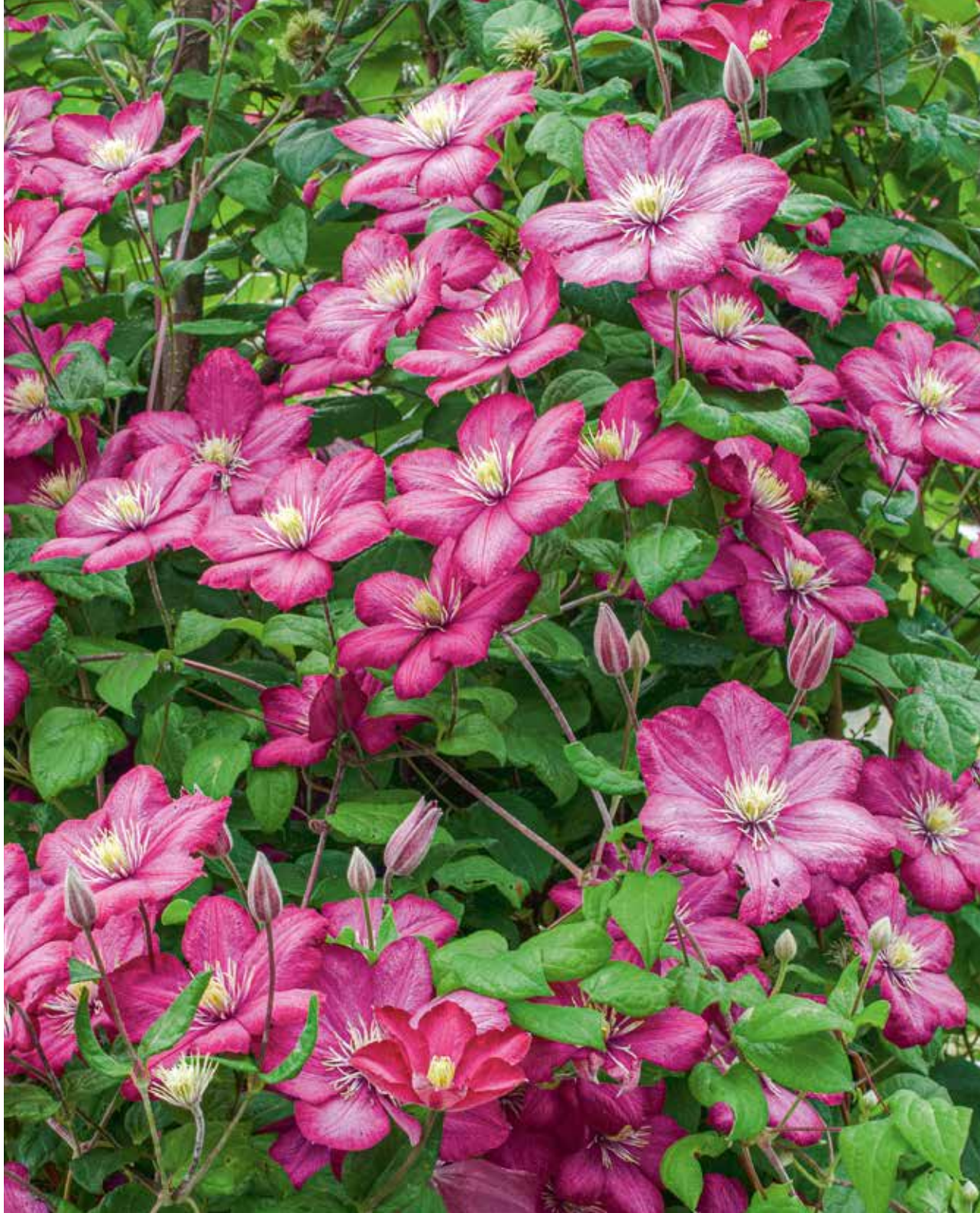
CLEMATIS 'VILLE DE LYON' ANNA BROCKMAN/RHS

For more information visit rhs.org.uk/plants/plantsmanship/ plant-societies