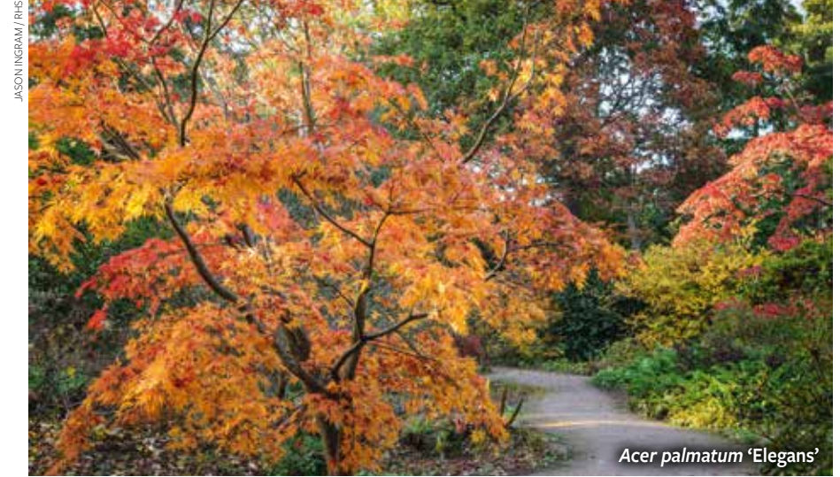
Acer palmatum 'Elegans'