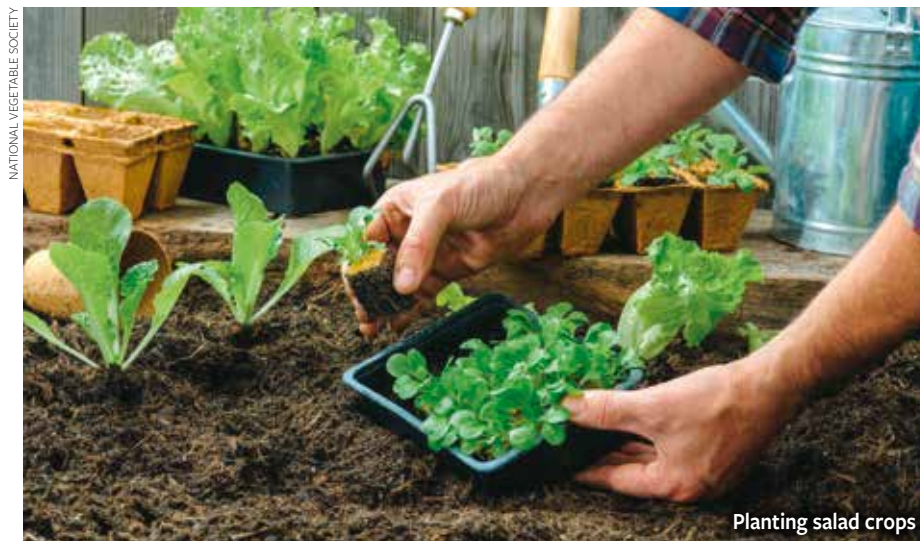
Planting salad crops