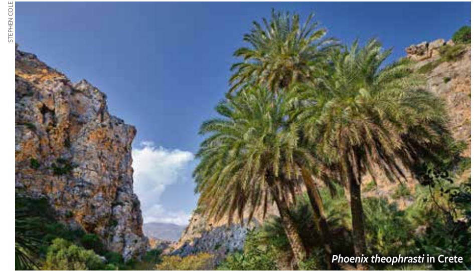
Phoenix theophrasti in Crete