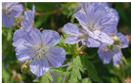
HARDY GERANIUM GROUP

A must for snowdrop enthusiasts, Group members brave the cold and meet in February to admire the diversity of these gorgeous bulbs and for a chance to buy some of the more unusual cultivars. galanthus@hardy-plant.org.uk