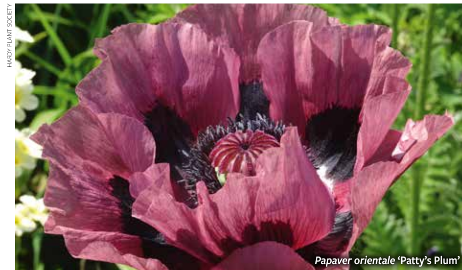
Papaver orientale 'Patty's Plum'