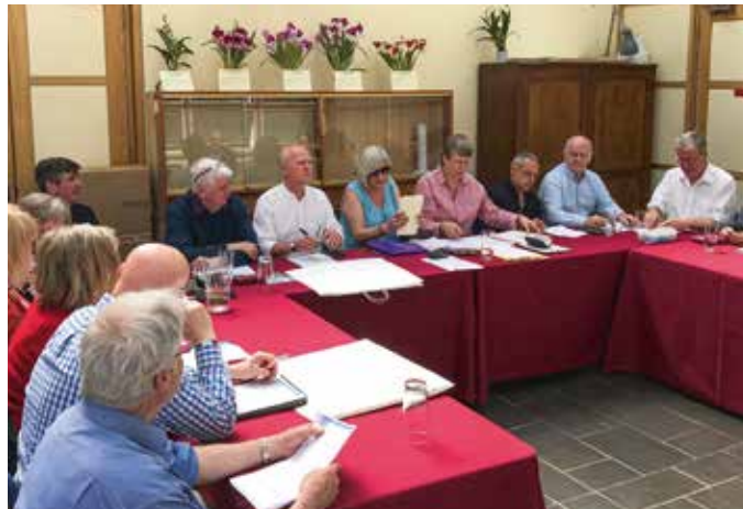
Committees such as the RHS Orchid Committee regularly assess plants for awards.

The committee was formed in 1889 and holds meetings around the country, working with local orchid societies and assessing more than 200 orchids for RHS plant awards every year. It has strong international links and its members represent the committee and the RHS at events all over the world. The committee