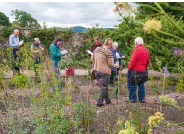
RHS plant committee members add their expertise to trial judging.

The committee, formed in 1859 as the Floral Committee and renamed in 2005, has a huge remit covering hardy