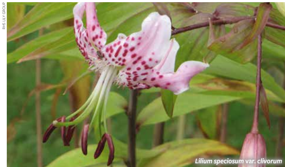
Lilium speciosum var. clivorum