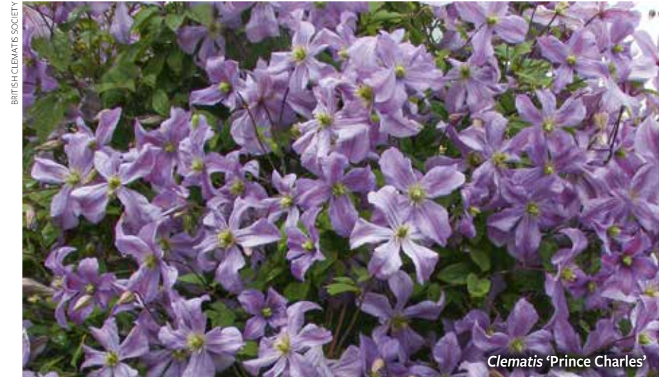
Clematis 'Prince Charles'