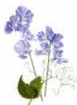
NSPS Founded 1900