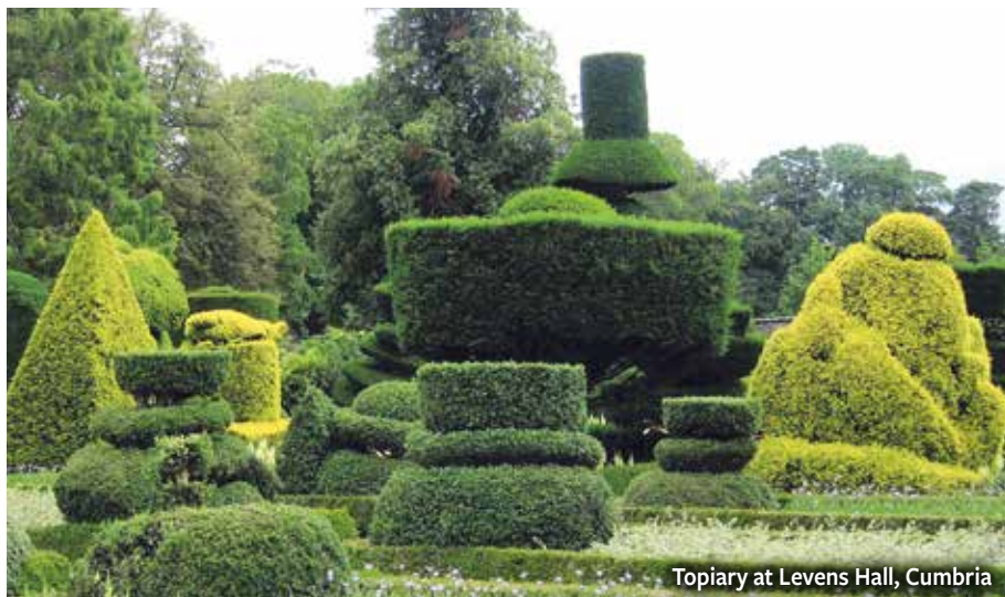
Topiary at Levens Hall, Cumbria