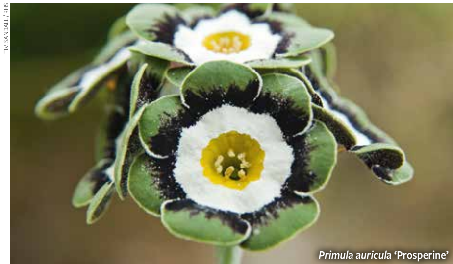
Primula auricula 'Prosperine'