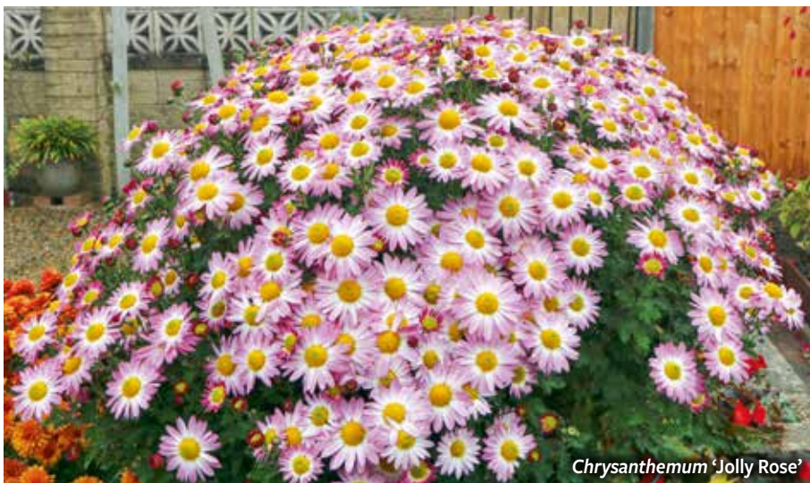
Chrysanthemum 'Jolly Rose'