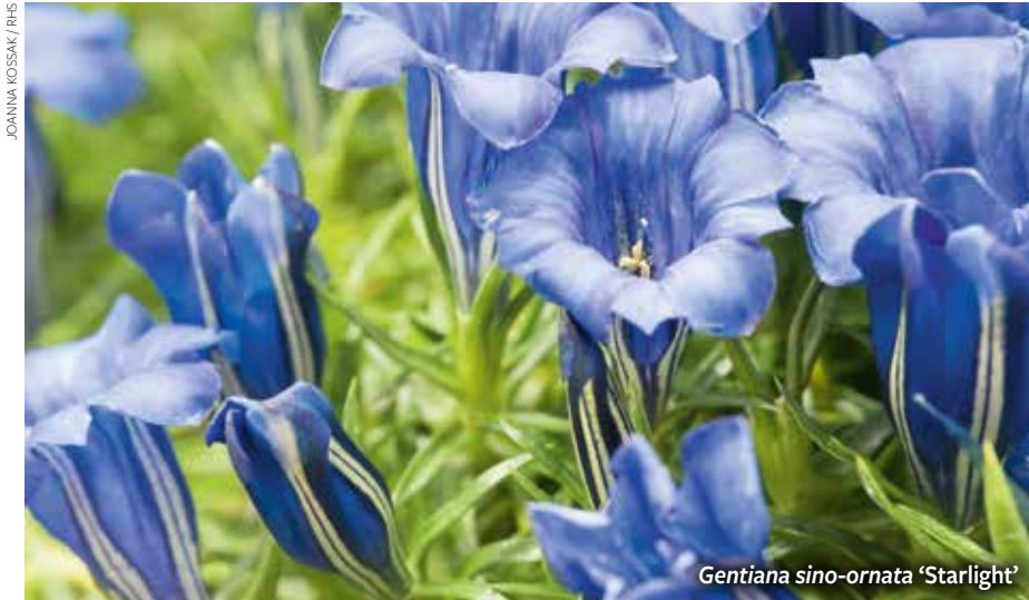
Gentiana sino-ornata 'Starlight'