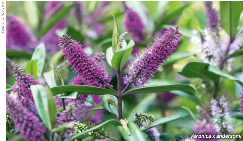
Veronica x andersonii