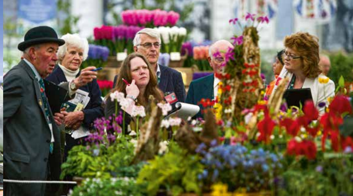
Many RHS plant committee members sit on panels judging floral exhibits at RHS shows.

herbaceous perennials including carnations and pinks, chrysanthemums, delphiniums and grasses. It works collaboratively with the Tender Ornamental Plant Committee on the assessment of seasonal bedding plants, both in formal trials and within the rolling review of the Award of Garden Merit. The RHS is the International Cultivar Registration Authority for dahlias, delphiniums and dianthus.