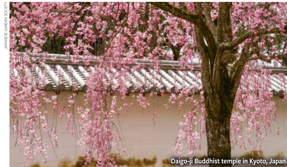
Daigo-ji Buddhist temple in Kyoto, Japan