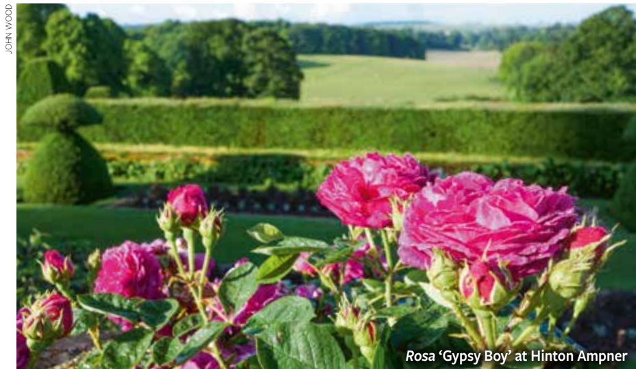
Rosa 'Gypsy Boy' at Hinton Ampner